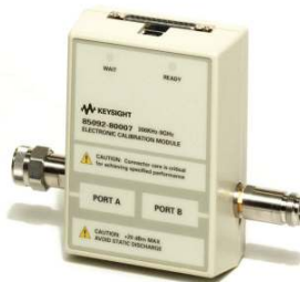
Electronic calibration (ECal) modules