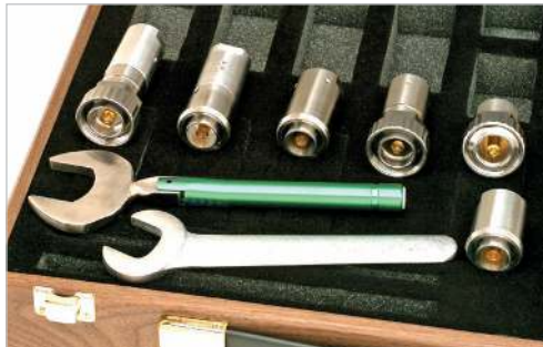
Mechanical calibration kits