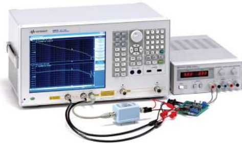
Pomona 3787-C-18 test lead (connected to gain-phase receiver ports) Pomona 2886 BNC breakout (connected to 0017CC)

Picotest web page: http://www.picotest.com