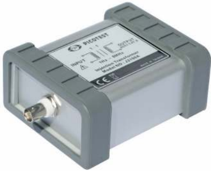
Picotest J2100A Injection Transformer