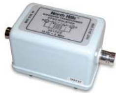
North Hills Signal Processing 0017CC