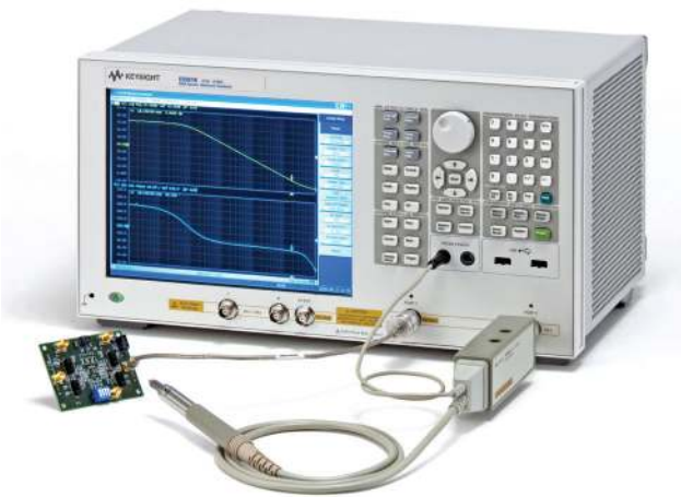
41800A and E5061B