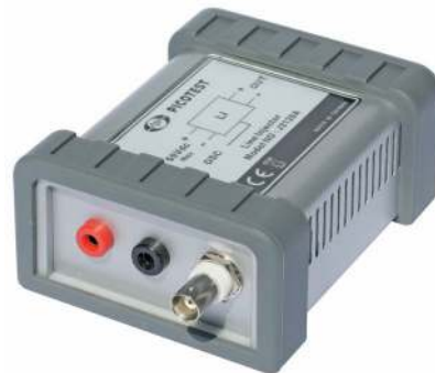
Picotest J2120A Line Injector