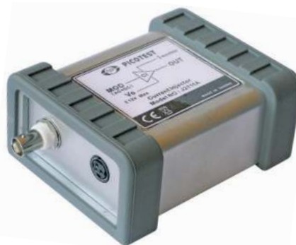
Picotest J2111A Current Injector